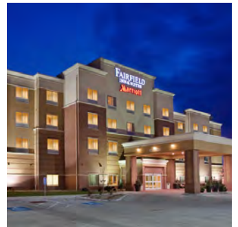
FAIRFIELD INN 308.236.4200